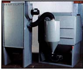
RECLAIMER AND D10 DUST COLLECTOR